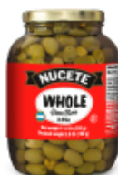
WHOLE GREEN OLIVES

4 x 2000g/3000g COD: 30002106 NCM: 2005.70.00.111V