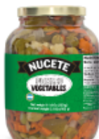
PICKLED VEGETABLES (JAR)