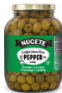
STUFFED GREEN OLIVES

4 x 1500g/3000g COD: 30002108 NCM: 2005.70.00.121V