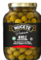
WHOLE GREEN PREMIUM OLIVES

4 x 2000g/3000g COD: 30002113 NCM: 2005.70.00.123C