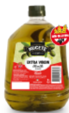
CLASSIC PET (2000cc)

12 x 500ml COD: 30006999 NCM: 1509.20.00.100R