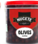
PITTED BLACK OLIVES

4kg/8kg COD: 30002059 NCM: 2005.70.00.122U