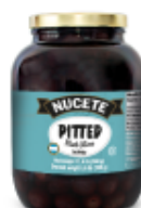
PITTED BLACK OLIVES

4 x 2000g/3000g COD: 30002109 NCM: 2005.70.00.119M