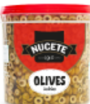
SLICED GREEN OLIVES

4kg/8kg COD: 30002058 NCM: 2005.70.00.121V