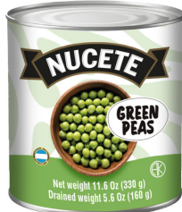
Canned green peas