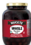
WHOLE BLACK OLIVES

4 x 2000g/3000g COD: 30002114 NCM: 2005.70.00.111V