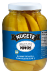
PICKLED PEPPERS (JAR)