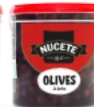
WHOLE BLACK OLIVES

5kg/8kg COD: 30002064 NCM: 2005.70.00.123V