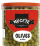
WHOLE GREEN OLIVES