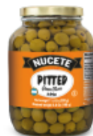
PITTED GREEN OLIVES

4 x 2000g/3000g COD: 30002106 NCM: 2005.70.00.111V