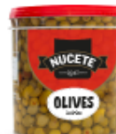
STUFFED GREEN OLIVES

4kg/8kg COD: 30002060 NCM: 2005.70.00.129J