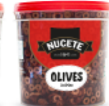
SLICED BLACK OLIVES

4kg/8kg COD: 30002059 NCM: 2005.70.00.122U