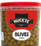
PITTED GREEN OLIVES

4kg/8kg COD: 30002058 NCM: 2005.70.00.121V